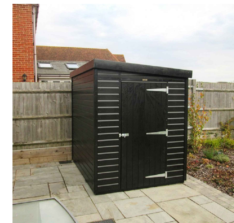
EXAMPLE SIMILAR STORE