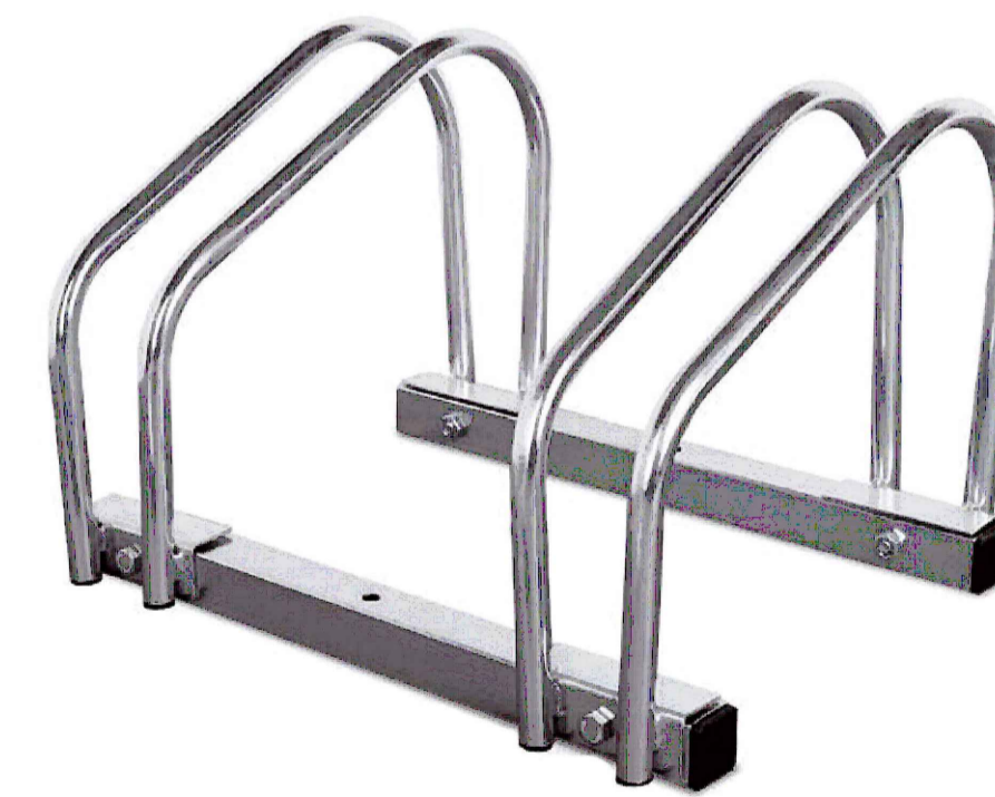
FLOOR MOUNTED WHEEL CLAMP